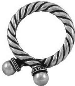
Equestre, Rope N6004