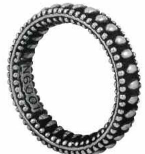
Sanzio, Lines & Dots N6001