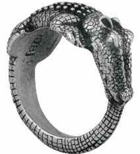
Pollino, Alligator N6008