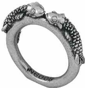
Pollino, Koi N6006