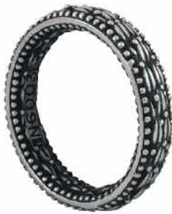
San Michele N6003