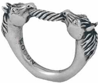
Equestre, Horse N6005